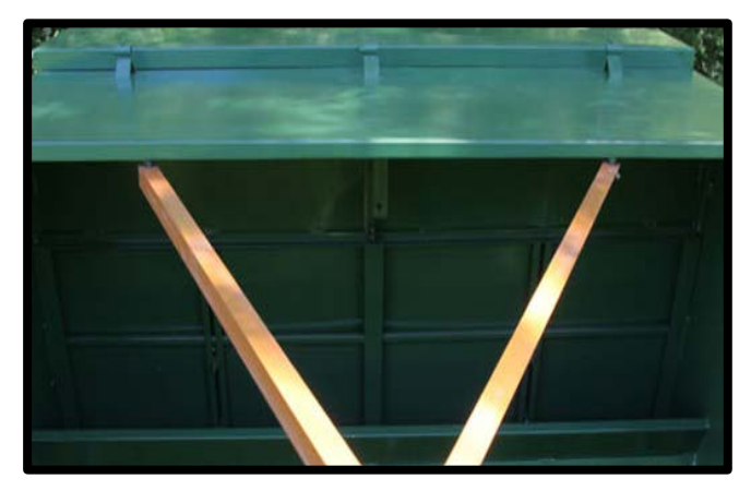
Lower Doors and Canopy