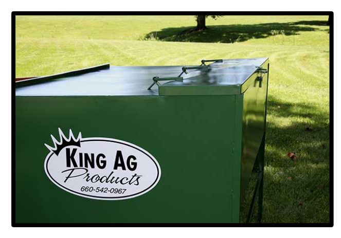
Ground Controlled Lid